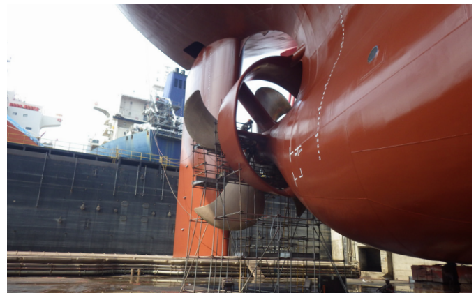
Euronav's VLCC Sara in drydock at Singapore, in December 2015. Our Technical Service team works closely with Euronav throughout all coatings applications to ensure the process is fast and application quality is high.