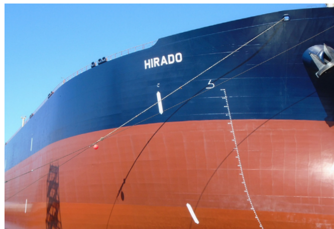
Euronav's VLCC Hirado in Dubai in December 2015