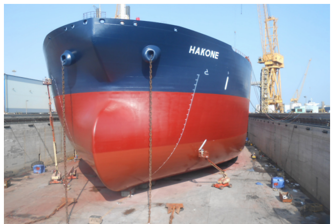
Euronav's VLCC Hakone at NKOM, Qatar.